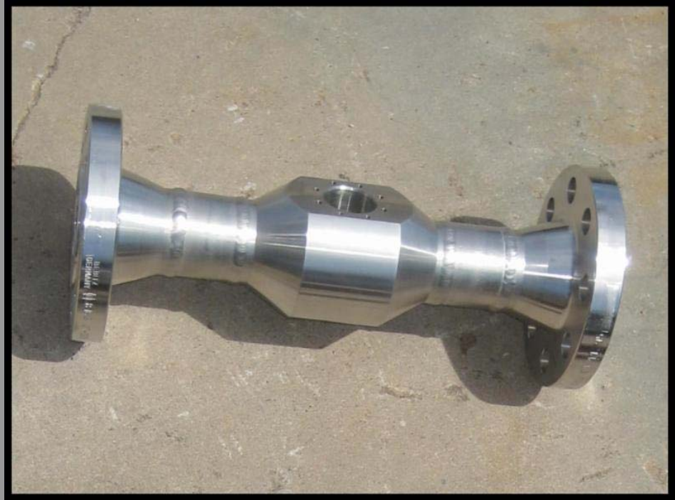
Large & Small Projects