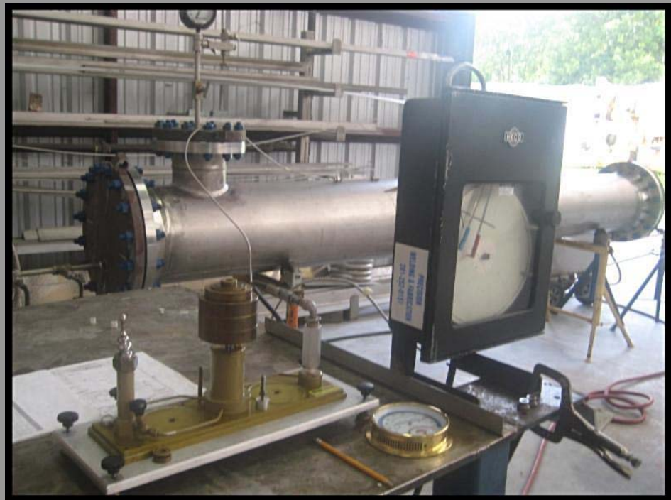
NDT, Hydro, Pickle, & Passivation Services Available